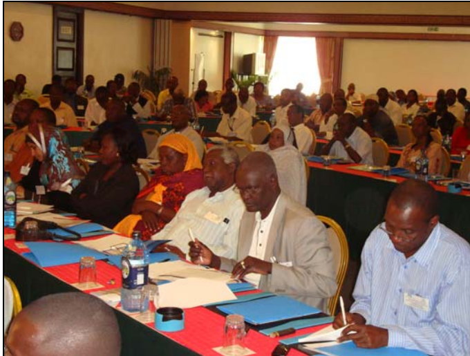
Photo2: Workshop Participants at the Coast Opinion Leaders Forum on Land Reforms

A Professionals Forum on Land Reforms was organised by ISK under the auspices of the Association of Professional Societies in East Africa (APSEA) and held on Tuesday, 21 st July 2009 at the Safari Park Hotel. The 184 forum participants comprised mainly of professionals in different sectors, private sector practitioners, government officers and representatives of religious and civil society organisations.