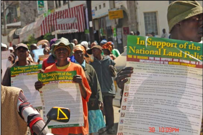
Photo 1: Road Show prior to the launch of the "The People’s National Land Policy” on 26th June 2009.